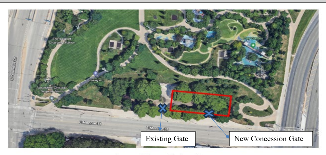
Proposed Concession Location